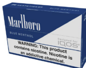
Figure 3 Marlboro Blue Menthol HeatSticks