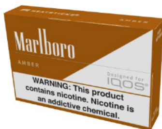
Figure 2 Marlboro Amber HeatSticks