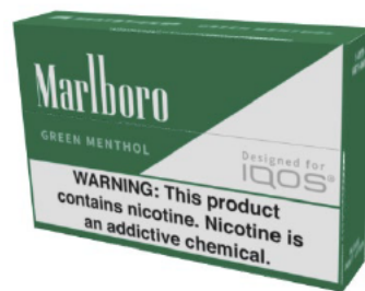
Figure 4 Marlboro Green Menthol HeatSticks